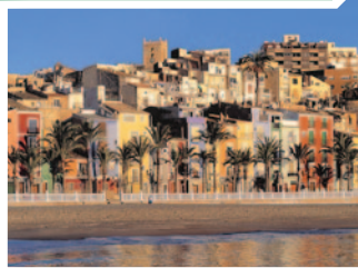
La Vila Joiosa