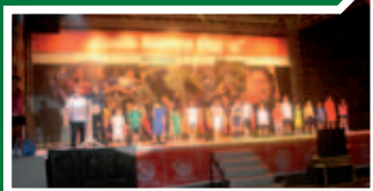
Costa Blanca Cup

XXX Half Marathon and II 10 km race "Town of Benidorm": These long distance races will be held on the 24th of November and run throughout attractive areas of the town. Twenty-eight editions of this prestigious event have taken place to date. Designed for active people who are eager to try this sport along an urban circuit